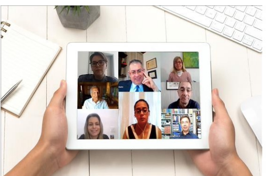
novidade da audiência internacional